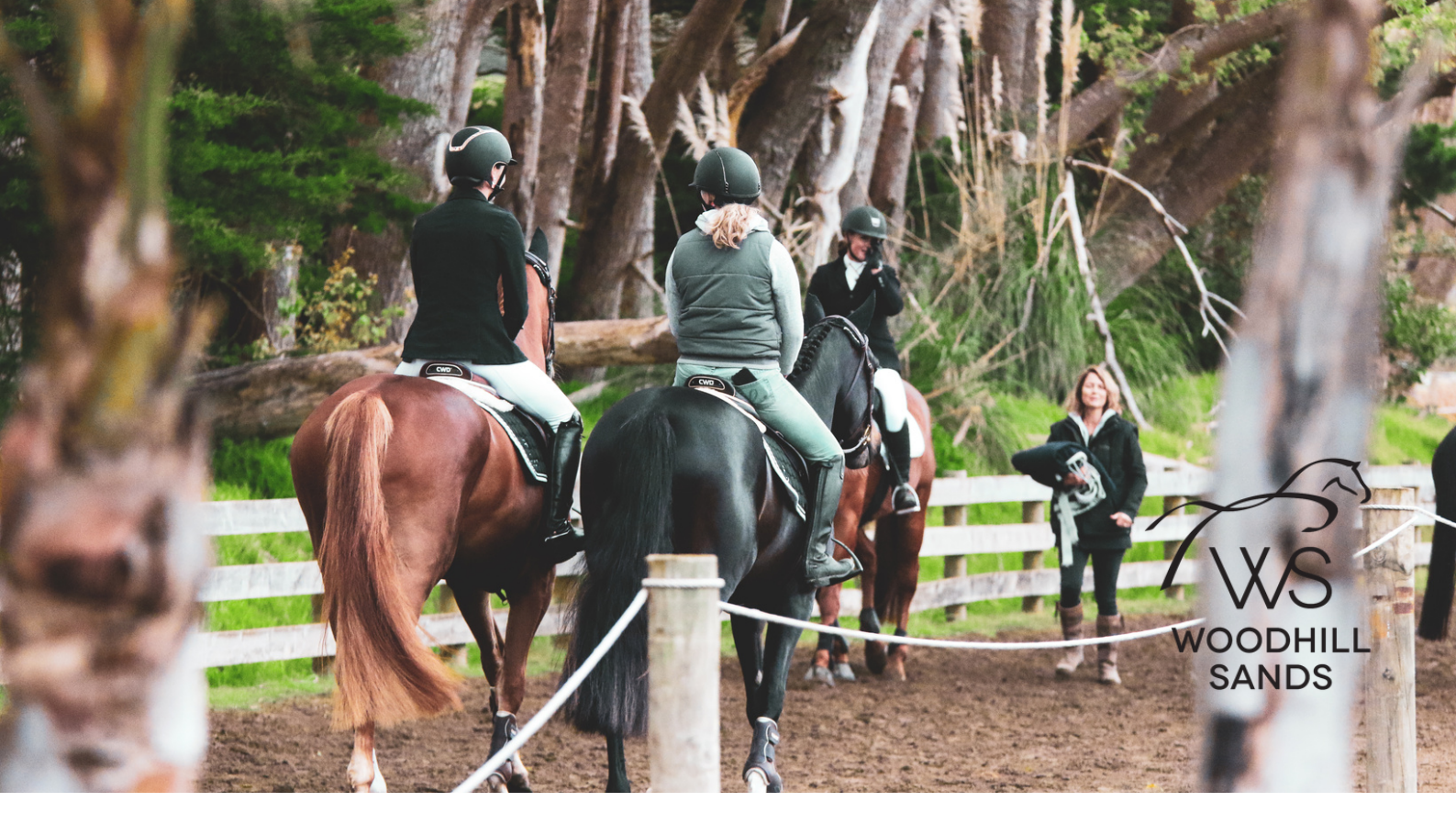
The Woodhill Sands Story

Woodhill Sands is a story of collaboration across the equestrian community, to ensure a lasting place for equestrian sports competition and training in the Auckland Region. Woodhill Sands Equestrian Centre is a community led development purchased by the sport through The Woodhill Sands Trust, in October 2017 to secure ongoing access to this wonderful venue.